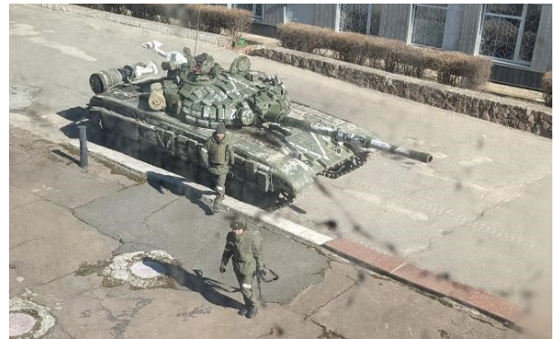
Photo 2: Russian soldiers on the territory of the ChNPP. 46

On the same day, Ukraine notified the IAEA that "unidentified armed forces" had seized control of all Chornobyl Nuclear Power Plant facilities in the Exclusion Zone. 47 The IAEA Director General reminded that any armed attack on nuclear facilities for peaceful purposes violates the principles of the United Nations Charter, international law, and the Agency's Statute. 48