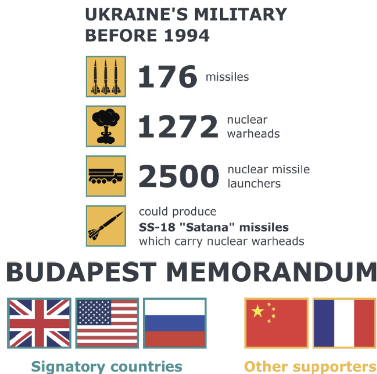
Figure 1. The Budapest Memorandum: security assurances and Ukraine's nuclear arsenal

On 5 December 1994, Ukraine signed the Memorandum on security assurances in connection with Ukraine's accession to the Treaty on the Non-Proliferation of Nuclear Weapons (the Budapest Memorandum) . 32 The Budapest Memorandum on Security Assurances, signed in 1994, is a diplomatic agreement involving Ukraine, Russia, the United States, and the United Kingdom. This document outlines the assurances provided to Ukraine and the commitments made by the signatory parties.