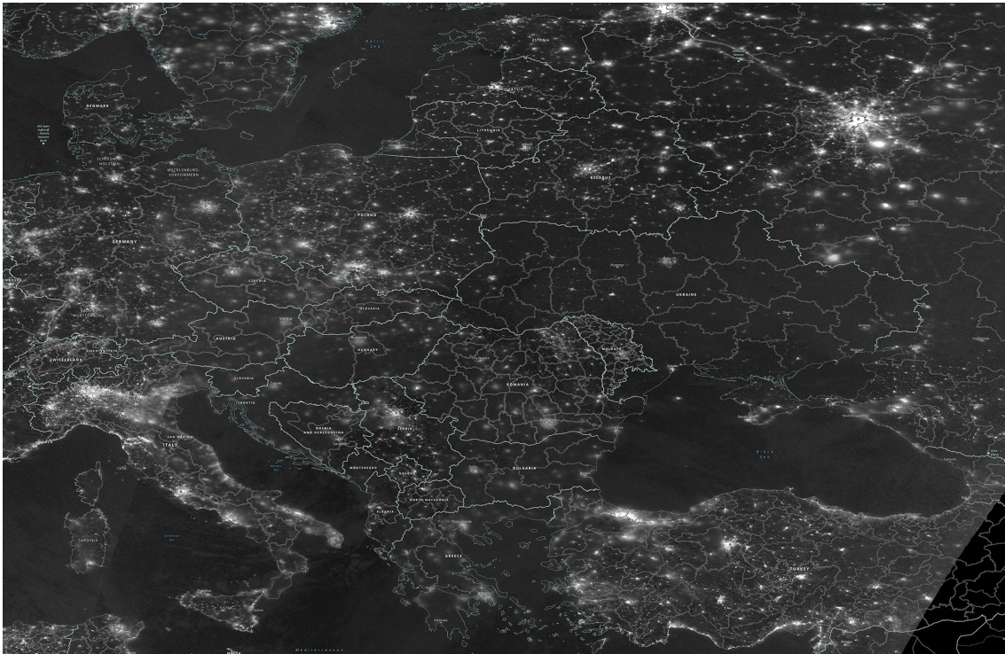
Photo 4. Satellite photo of Europe showing the blackout in Ukraine on 23 November 2023 88

The accident at the Fukushima NPP demonstrates why the lack of a reliable electricity supply poses significant risks. Before the conflict, ZNPP had four 750kV and six 330kV lines available. Currently, it relies on one or two lines that are constantly shelled. 87