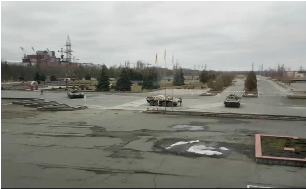
Photo 1: Russian tanks at the ChNPP, screenshot from the video taken by the personnel.

The station's staff, who had started their shift on 23 February 2022, became hostages of the Russian military and had to work over 600 hours instead of the planned 12-hour shift. According to the IAEA report, the personnel was forced to work under armed guard without the chance of rotation. The Russian colonel explained the feelings of the head of the ChNPP: "He said that he hated us, but he swore an oath to the IAEA and would ensure the station's safety." 43 Personnel rotation became possible only on March 20. 44