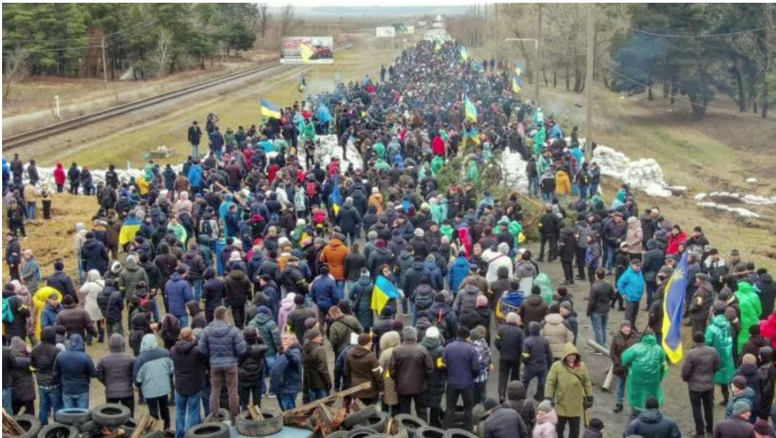
Photo 3. Ukrainian civilians blocking the road to the ZNPP aiming to prevent Russian occupation

The actions of Russian troops in Ukraine represent the first instance of an operational nuclear power plant being directly targeted for military attack and occupation. The Zaporizhzhya nuclear power plant, now with military equipment stationed on its premises, has been embroiled in prolonged hostilities.